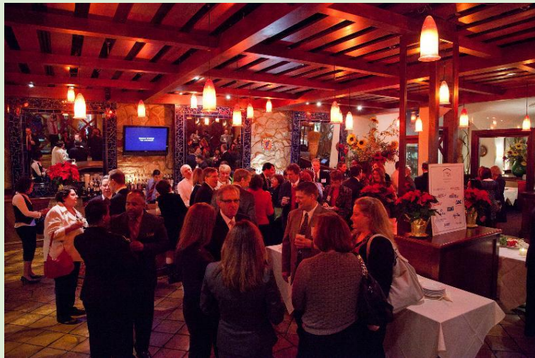
Guests mingling at Finnemundo before the show